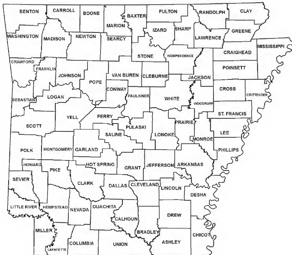
Figure 1. County map of Arkansas.